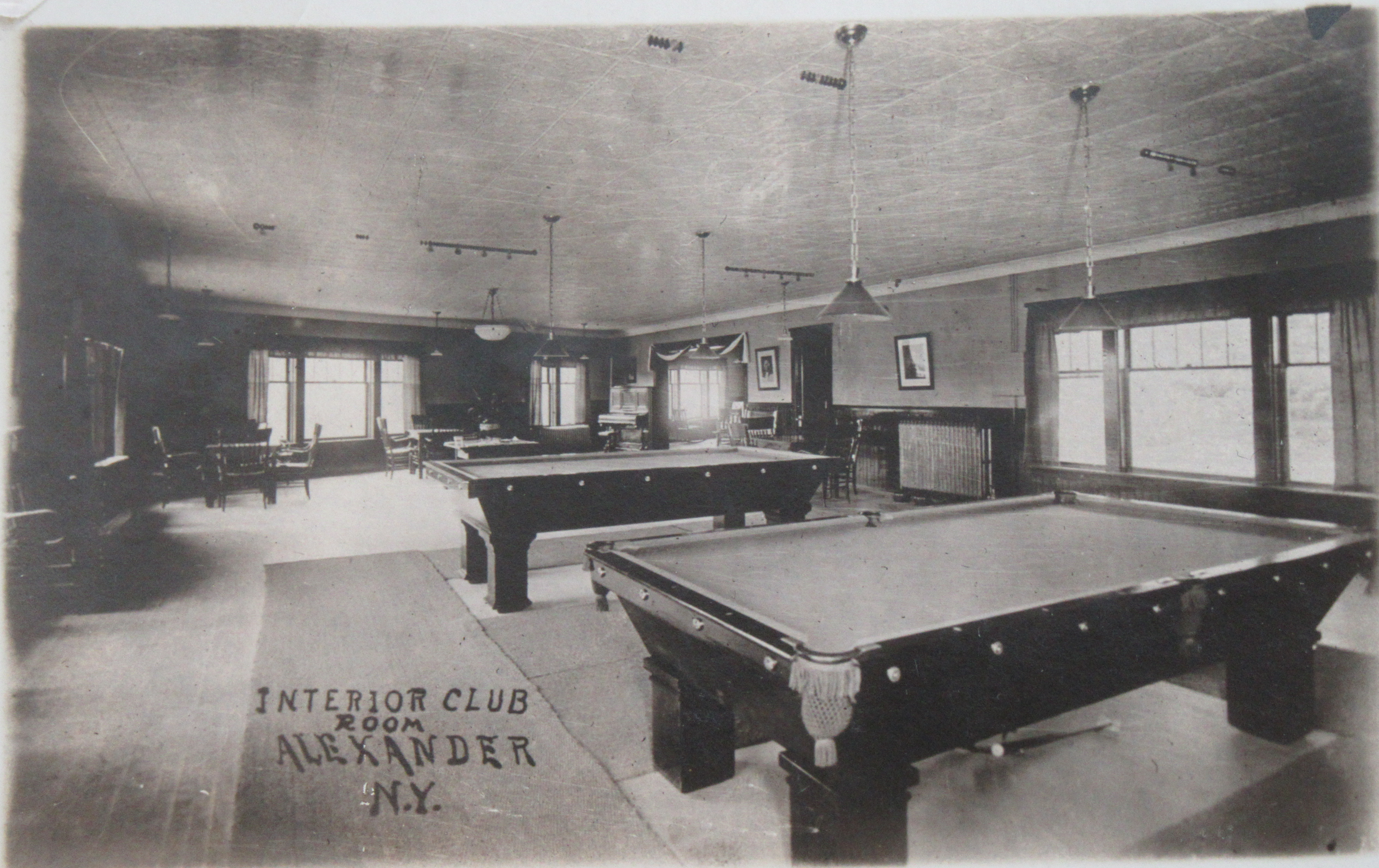
INTERIOR CLUB ROOM ALEXANDER N.Y.